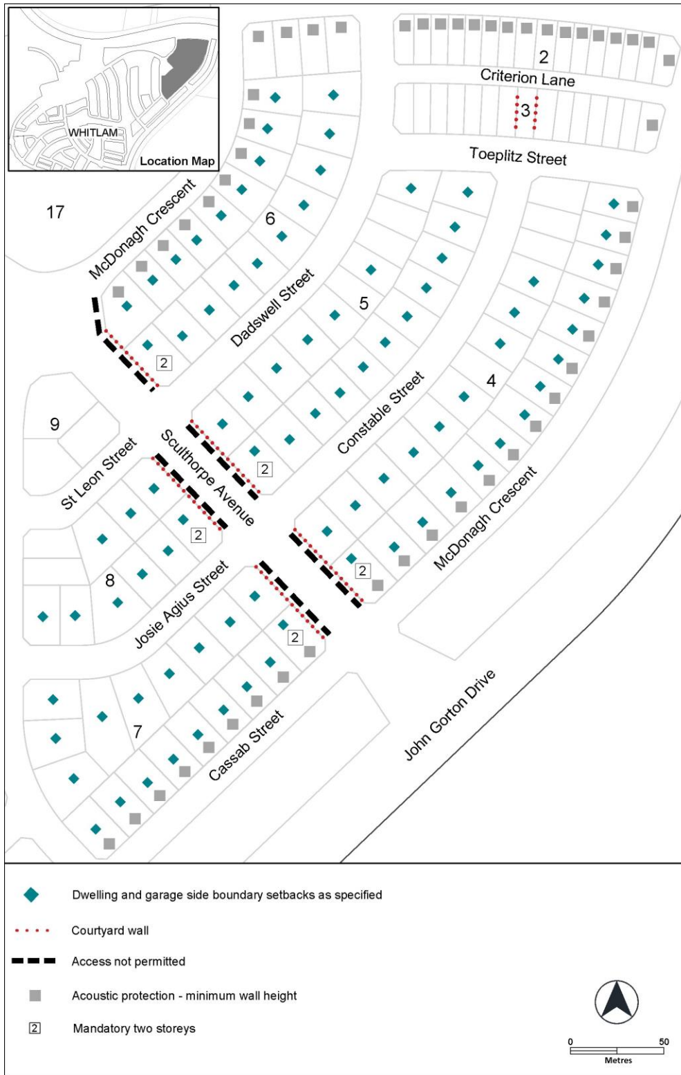
Figure 4 Whitlam residential area 4