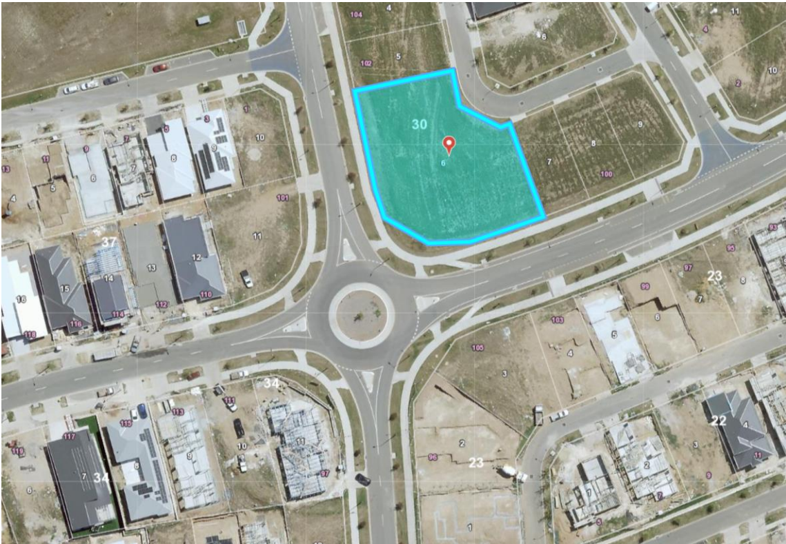
Location map – Whitlam section 30 block 6

Figure 2 is being amended to permit vehicle access to the north-western corner of section 30 block 6 fronting Hazel Hawke Avenue. This is in response to a detailed design review for the site which has revealed constraints in trying to accommodate northern solar access and private open space requirements if vehicle access is to the north-eastern street boundary.