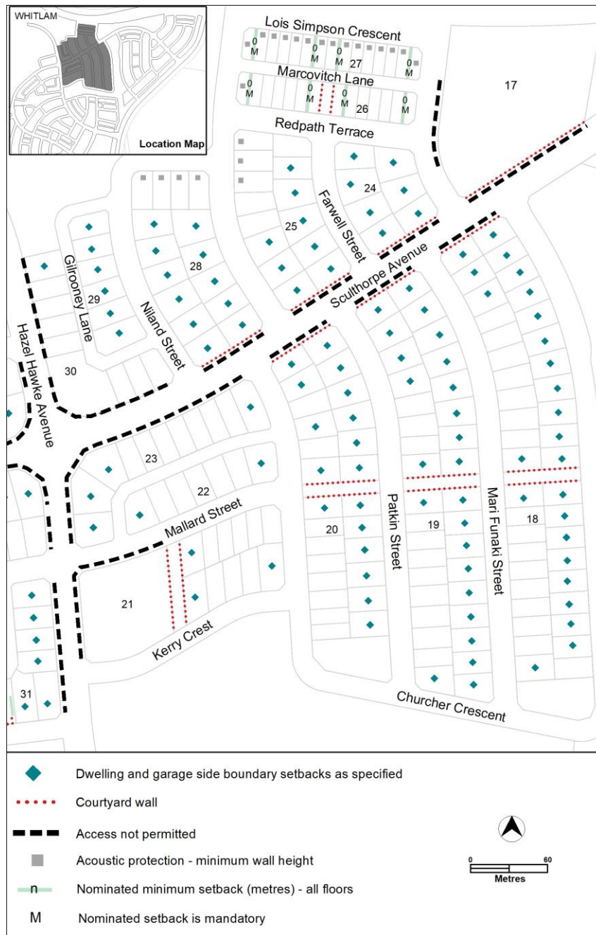
Figure 2 Whitlam residential area 2