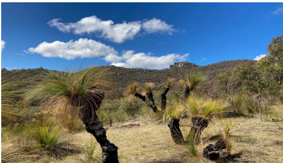
Grass trees ( Xanthorrhoea ) on the Xanthorrhoea Loop Trail, Tidbinbilla.