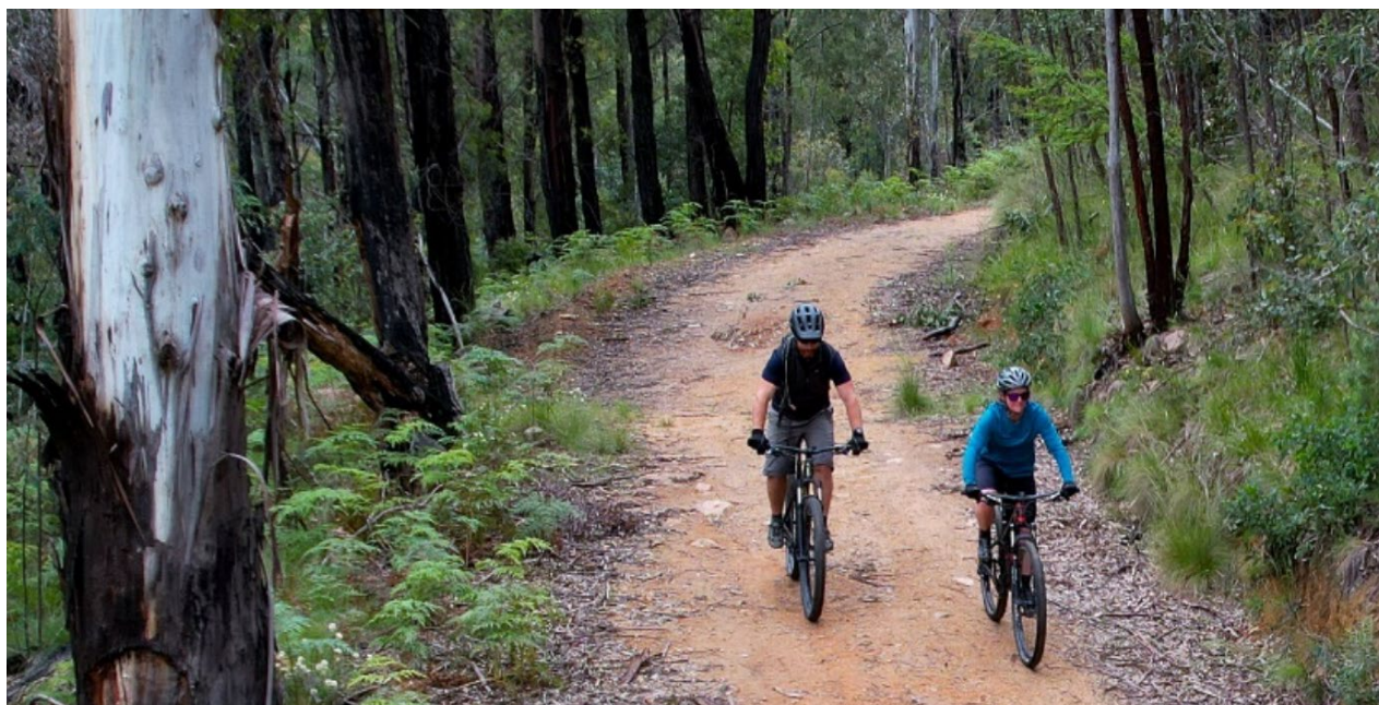
Visitors enjoying mountain biking, Tidbinbilla.