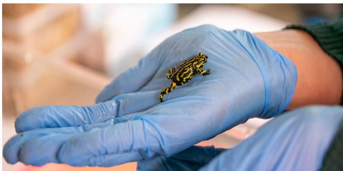
Northern Corroboree Frog ( Pseudophryne pengilleyi ), Tidbinbilla.

Established in 1996, the Brush-tailed Rock-wallaby program is the longest running threatened species breeding program at Tidbinbilla. Until 2015, the goal of this program was to produce a stable captive population for later release into the wild. However, the success of the program was compromised by a very narrow genetic profile within the breeding population. Due to this, the program's focus shifted and in 2017, Tidbinbilla partnered with the southern Brush-tailed Rock-wallaby Recovery Team, Zoos Victoria and the Australian Government's Threatened Species Commissioner's Office to establish a genetic rescue breeding program to produce a genetically diverse insurance population for release into a safe haven. The Tidbinbilla Safe Haven, large (120 ha) feral predator-proof fenced area, was completed in 2024. The breeding program successfully produced genetically diverse animals, and eight rock-wallabies have since been released into the Safe Haven. Further releases are planned for 2025.