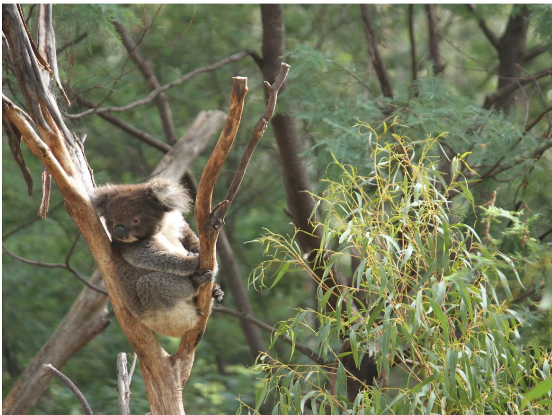
Koala (Gula) ( Phascolarctos cinereus ) at the Eucalyptus Forest, Tidbinbilla.

Following public consultation, work will commence to develop a new RMP for Tidbinbilla using a new Values-Based Management (VBM) approach.