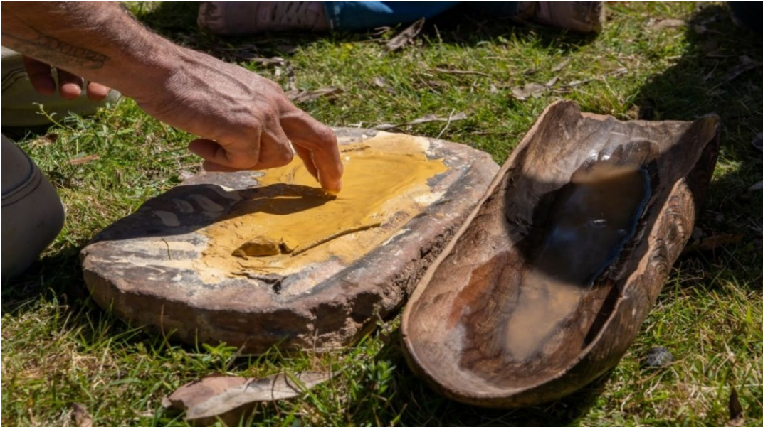
Ochre demonstration at Tidbinbilla Open Day, Tidbinbilla.

Traditional Custodians and PCS staff undertake cultural burns and associated land management activities aimed at meeting a range of objectives. These include protection of cultural assets, encouraging growth of bush tucker and other culturally important plants, maintenance of desirable vegetation structure, and connection to Country. The PCS remains committed to fulfilling the vision and achieving the objectives of the EPSDD Reconciliation Action Plan July 2023 – June 2025 (ACT Government 2023).