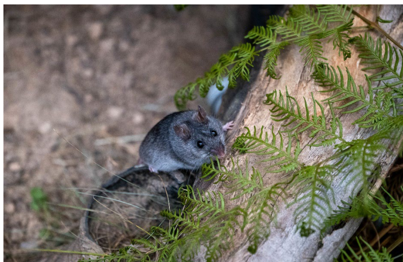
Smoky Mouse release ( Pseudomys fumeus ), Tidbinbilla.