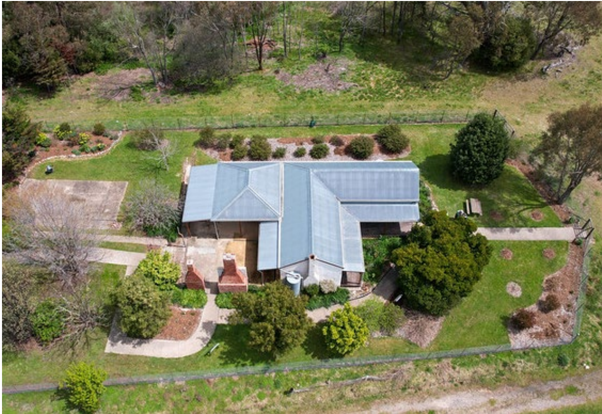
Bird's-eye view of Rock Valley Homestead, Tidbinbilla.

Tidbinbilla Pioneers Association was successful in obtaining a grant to prepare a draft CMP for Rock Valley Homestead and the surrounds. The draft CMP is expected to be submitted to the Heritage Council in 2025.