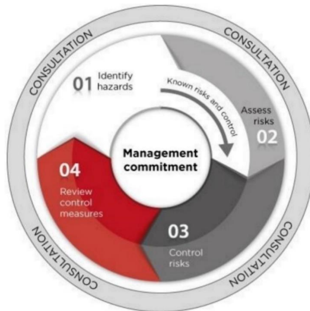
Figure 1 The risk management process

Many hazards and their associated risks are well known and have well established and accepted control measures. In these situations, the second step to formally assess the risk is unnecessary. If, after identifying a hazard, you already know the risk and how to control it effectively, you can implement the controls without undertaking a risk assessment.